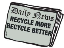
Plastic bag Mug+Plate Food scraps Drinking glass Newspaper