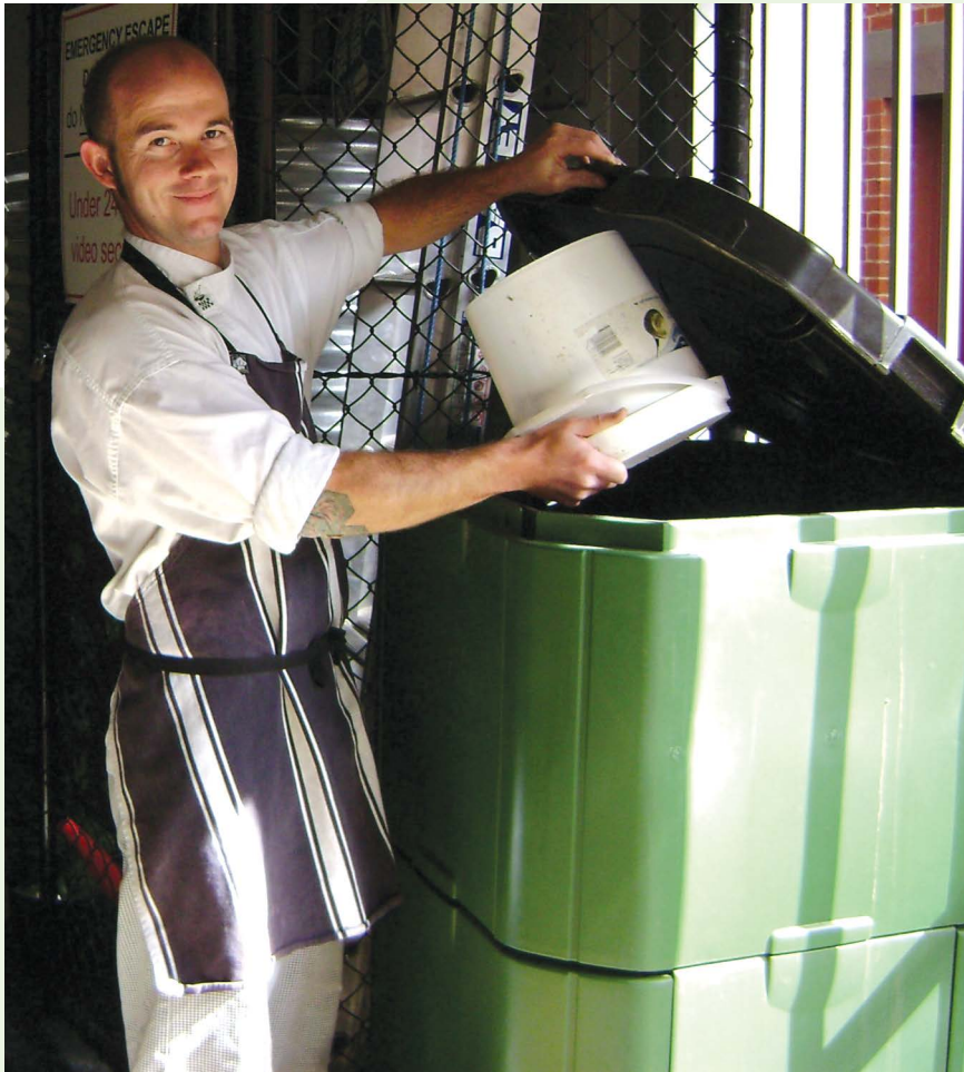
Composting vegetable scraps on-site reduces the amount of waste going to landfill